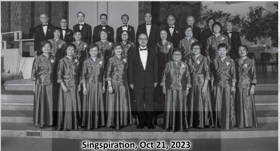
Singspiration, Oct 21, 2023